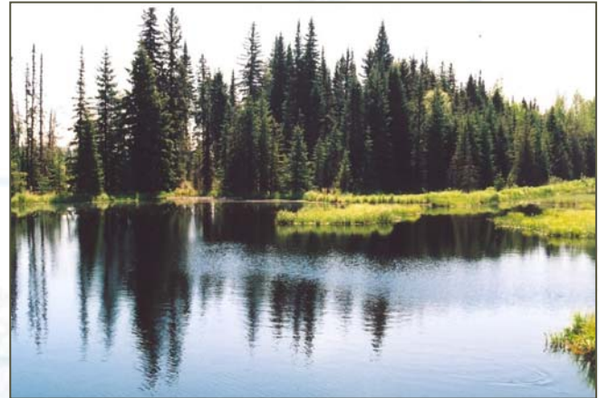
A beaver pond in the upland area of the Research Forest. These wetlands are important rearing habitats for waterfowl such as mallards and mergansers.