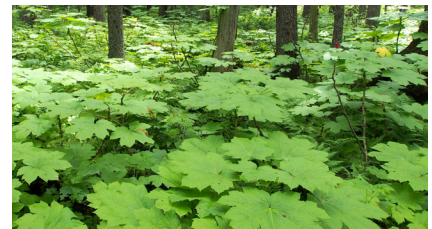
(LEFT) Skunk cabbage ( Lysichiton americanus ) (CENTER) Amanita mushroom ( Amanita muscaria ) (TOP RIGHT) Lady fern ( Athyrium filix-femina ) fronds (BOTTOM RIGHT) Devil's Club ( Oplopanax horridus ) on an ALRF seepage site

Introduced (planted) BC tree species within the ALRF (often in research trials or operational planting trials) include tamarack ( Larix laricina ), planted on sites within the ALRF similar to those where black spruce occurs, western white pine ( Pinus monticola ), and western larch ( Larix occidentalis ).