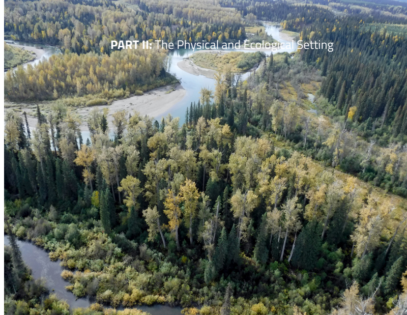
The lower Bowron River along the ALRF's southern boundary

Despite the moist to wet climate of the ALRF, there is evidence of rare but significant historical wildfires on the ALRF and in the surrounding area, with an estimated average fire return interval of perhaps 300 years or more at the stand level. The presence of old fire-seral lodgepole pine snags, scattered mature live pines in some stands, and the occasional occurrence