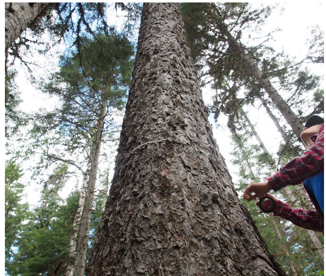
A large hybrid white spruce ( Picea glauca X engelmannii ) dominates the upper canopy of an older ALRF stand

Mature spruce-subalpine fir stands at the ALRF are generally two-aged to multi-aged. Within the ALRF, the lifespan of the