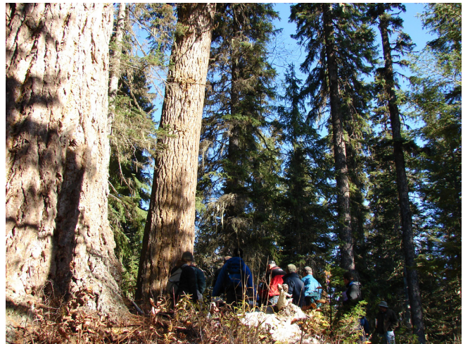
Large Douglas fir on a dry hilltop site at the ALRF

of charcoal in the upper soil horizons of these sites provide evidence of past natural forest fires within the ALRF landbase. Lightning strikes and small fires are sometimes observed on the ALRF during summer convective storms. For example, a recent small lightning-caused wildfire occurred in the east-central ALRF in May 2010. In addition, a number of lightning-scarred trees have been observed over the years on other ALRF locations as well.