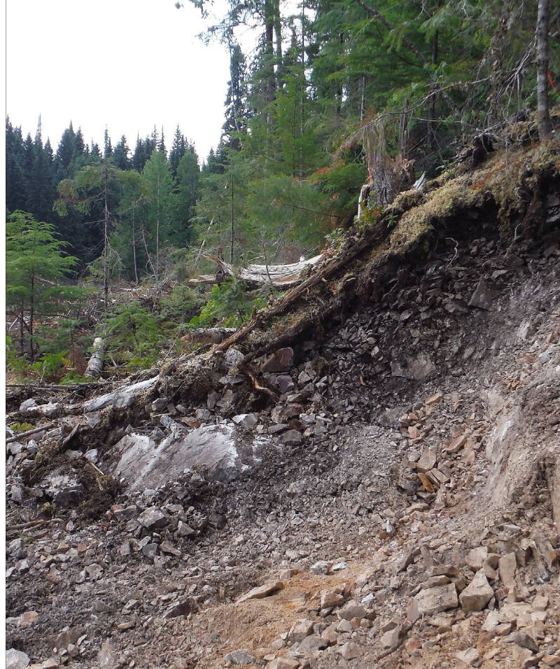
Forest vegetation growing over fractured bedrock and colluvial veneer soils near the West Bear Road, ALRF

The predominant landforms in the ALRF area are glaciolacustrine or fluvial in origin, dating from the post-glacial melt period, approximately 9,000 to 10,000 years before present. Regional studies of surficial geology indicate that the relatively low-lying Upper Fraser basin including the present-day ALRF was occupied by a large glacial lake basin (or a series of lake basins) during the late glacial period (Tipper 1971). Higher bedrock outcrops on the ALRF were islands in this large lake. Prevailing evidence suggests that lake levels remained stationary for periods of time, creating beaches and shoals composed