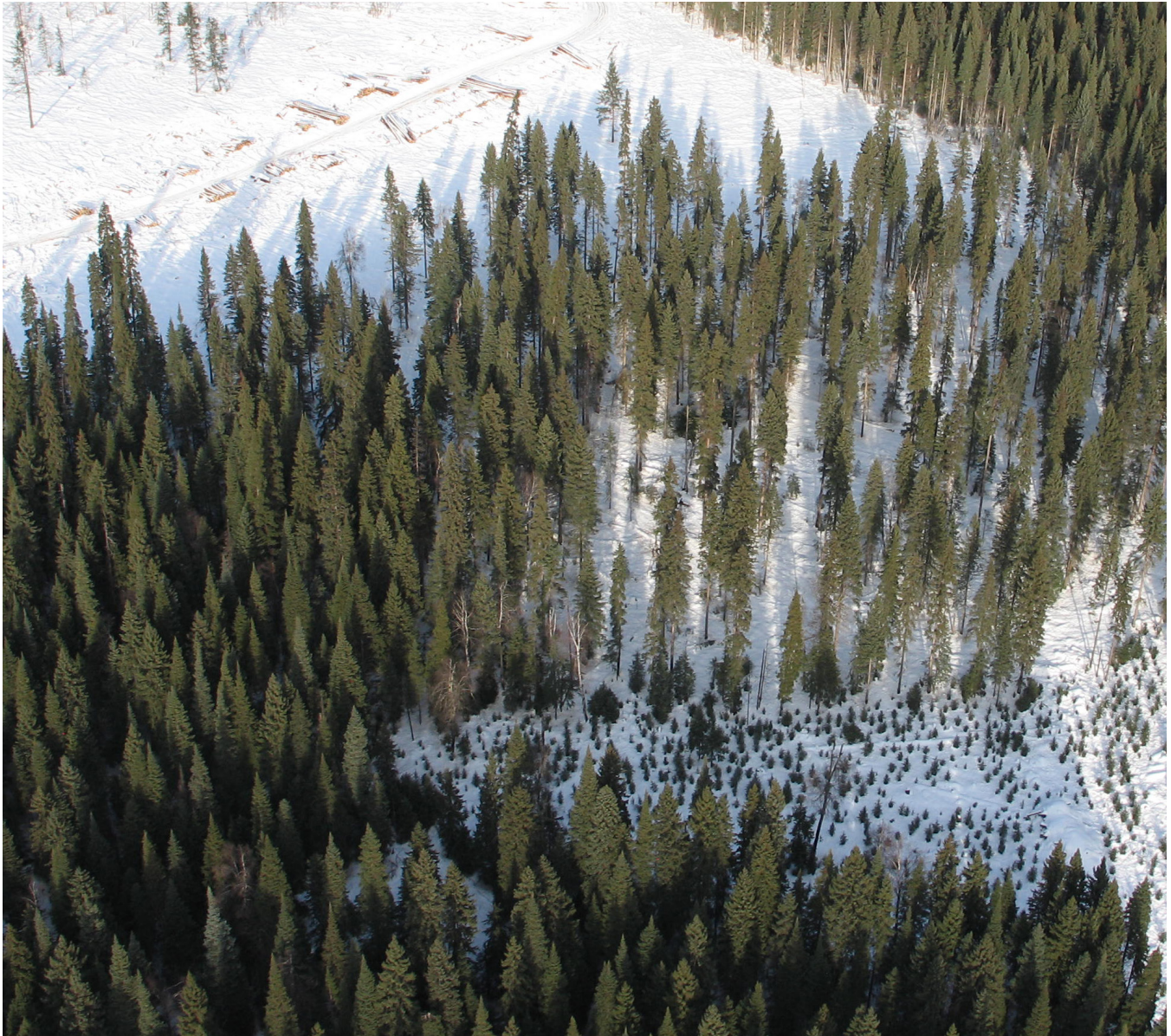
Aerial view south of the West Branch Road at the ALRF, illustrating a variety of silvicultural systems, including clearcut (upper photo), uniform shelterwood (centre of photo), and group / strip selection (lower photo)