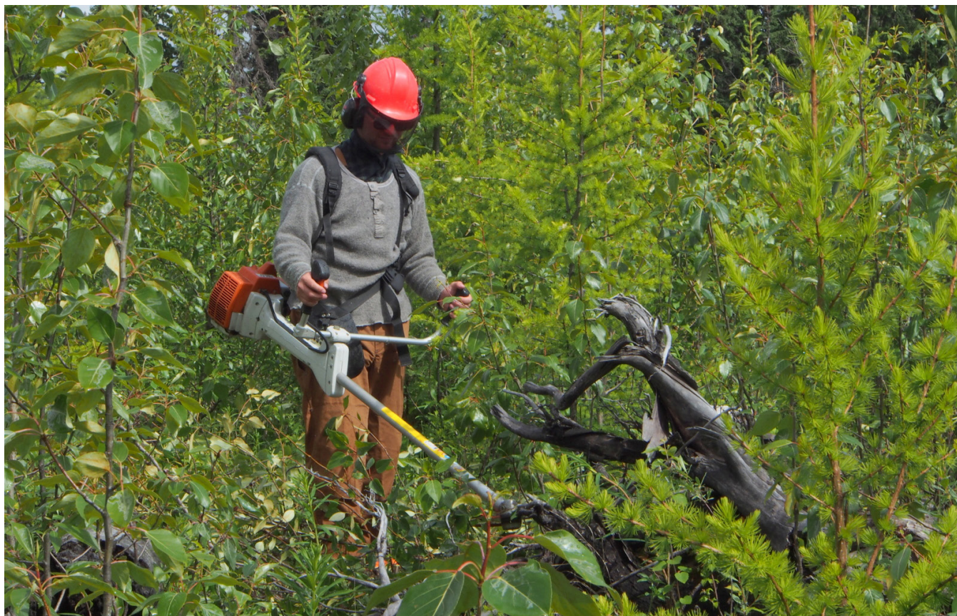
An ALRF summer student brush-saws cottonwood saplings to reduce brush competition in a 7-year-old western larch trial (East Branch Road area, ALRF)