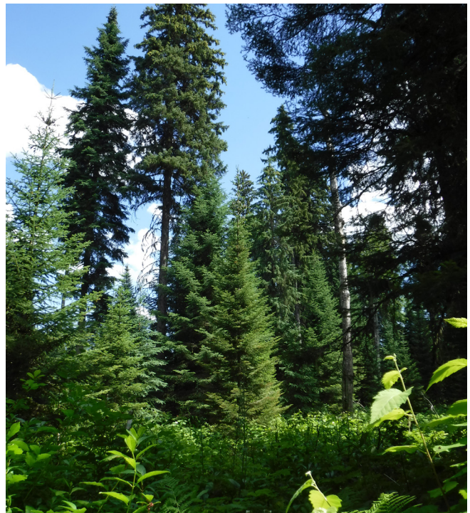
ALRF single-tree selection cut, harvested 1995, 40% volume removal