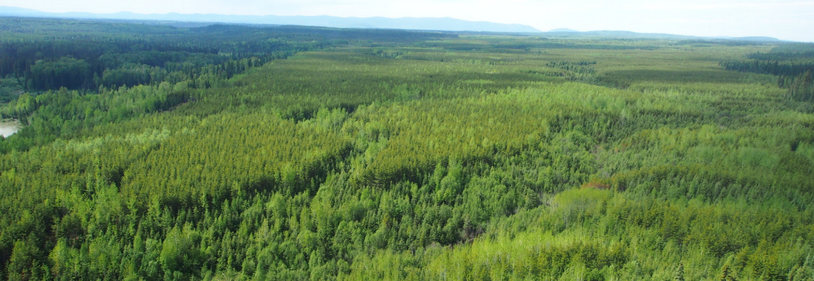
25-year old lodgepole pine and spruce plantations in the southwest of the ALRF