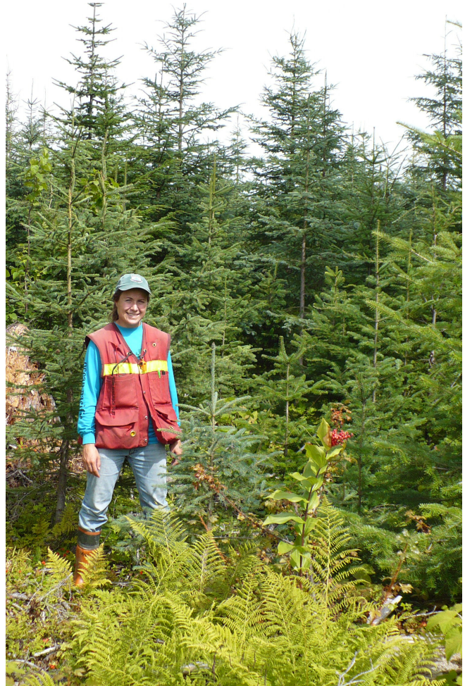
Although planting (artificial regeneration) is standard practice after logging at the ALRF, natural regeneration and “seeding in” from surrounding stands adds significantly to the diversity of the regenerating stand

Three other tree species native to British Columbia, but not the ALRF, that have been planted in ALRF research and demonstration trials in the past decade include western larch, tamarack, and western white pine. Western larch and western white pine are native to moister areas of the southern BC Interior, while tamarack does naturally occur in both boreal and sub-boreal BC ecosystems.