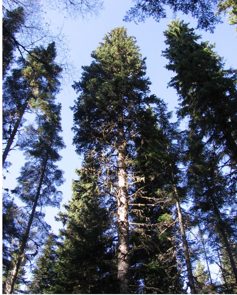
Mature ALRF spruce-subalpine fir stand, originally logged in 1927