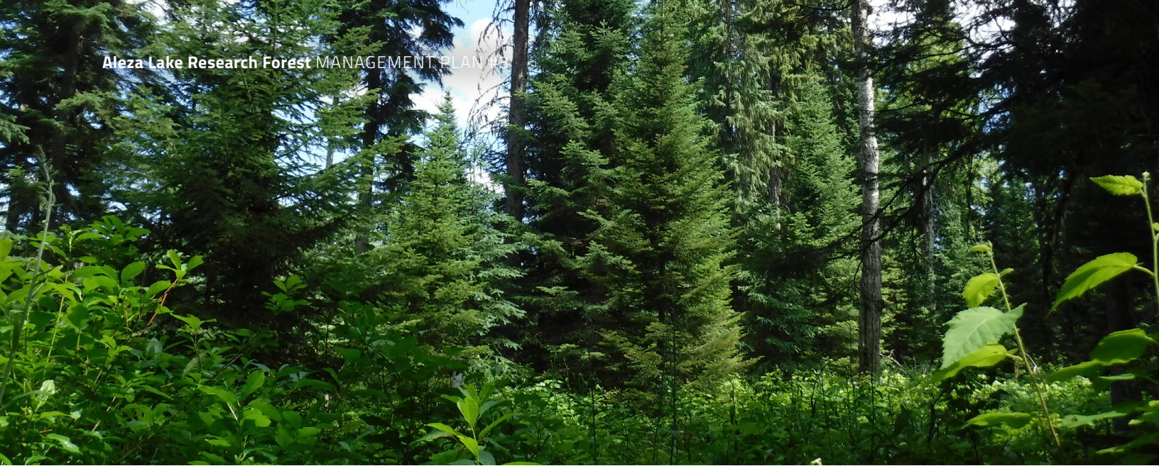
Single-tree selection-cut stand at ALRF in 2018, 23 years after a partial-cut stand entry to remove spruce-beetle-attacked trees.

Silvicultural systems that have been historically used at the ALRF generally include clearcut and patch cut systems, group (or strip) selection, irregular single-tree selection, uniform (and irregular) shelterwoods.