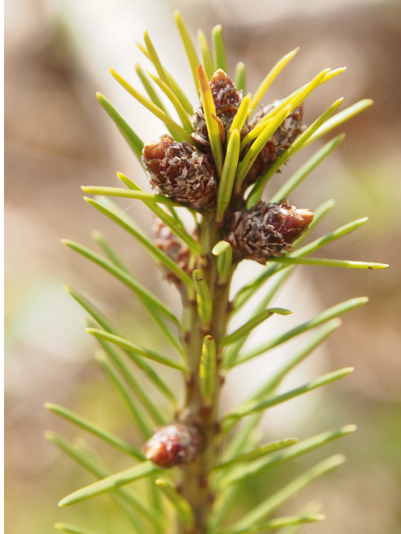
Douglas-fir is an increasing component of ALRF regeneration on drier sites

ALRF strategies for mitigating silvicultural risk in such applications will include one or more of the following: (a) keeping trials within a relatively limited proportion of the ALRF net area to be reforested in a given time period, (b) potentially establishing 'high-risk' seed sources as fill-plantings or minor admixtures among local natural regeneration and approved planted seedlots, and/or (c) rigorous documentation, monitoring and GPS / GIS mapping and recording of the locations of test plantings and trials.